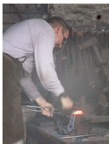
A demonstration of traditional iron chain making at the Black Country Museum