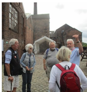
Some group members on a guided tour of Middleport Pottery

For more information and/or to join our mailing list (email only) contact the Group Leader