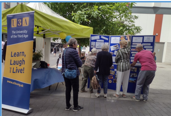
Orpington presentation at the Walnuts June 25 & 26