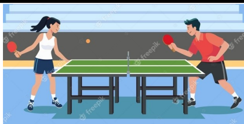
Table Tennis & Short Mat Bowls