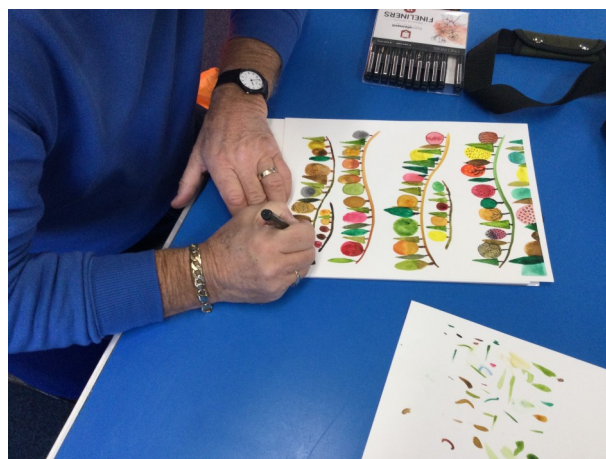
Painting Group members concentrating on their beautiful artwork