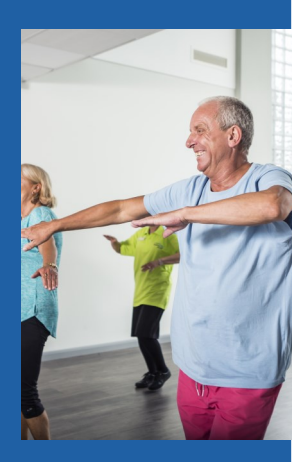
Primetime Classes for 60+

Crofton Halls Doors open at 2pm for refreshments until the main meeting starts at 2:30pm